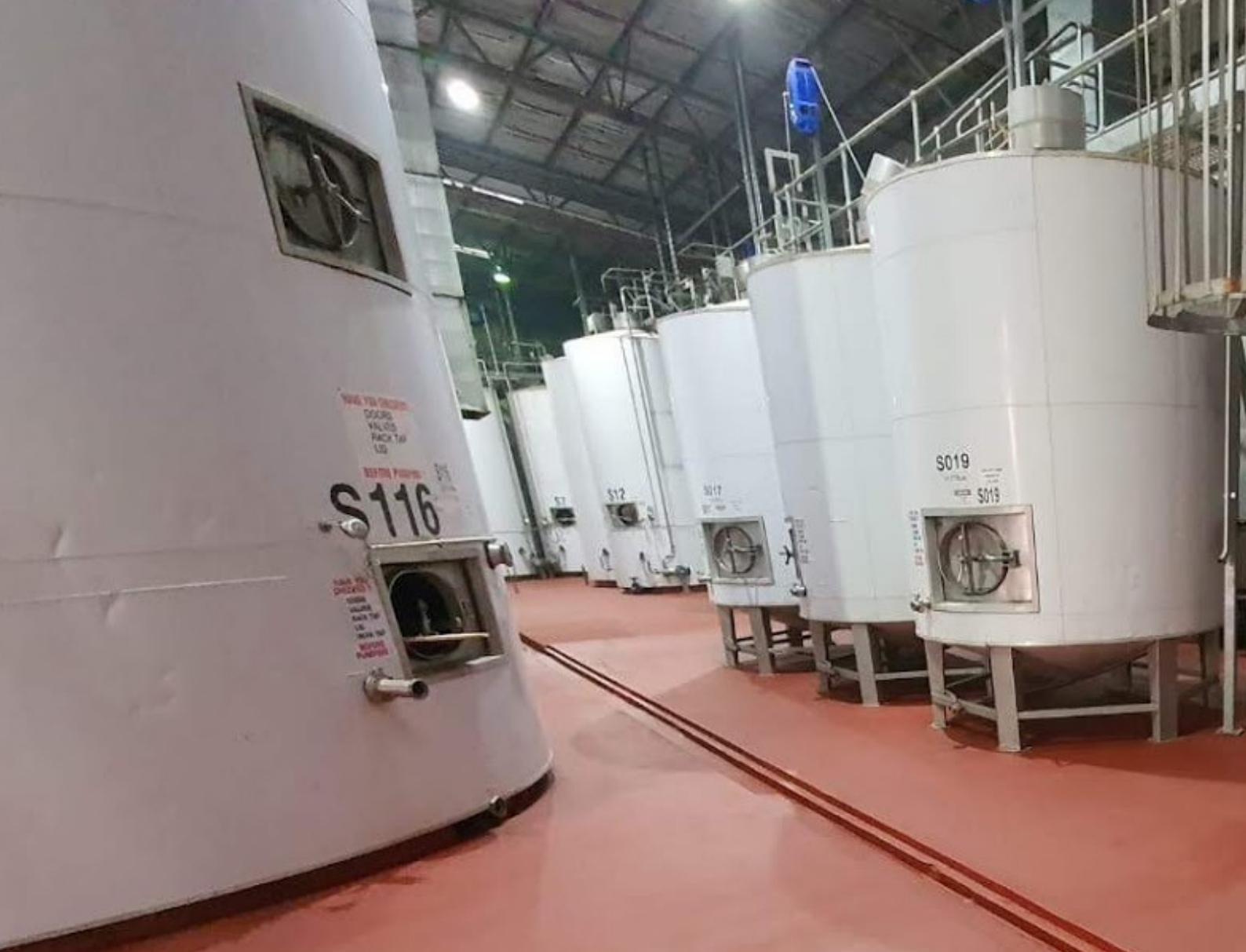
SteriFloor Beschützen in RAL 3009, Medium Non-Slip